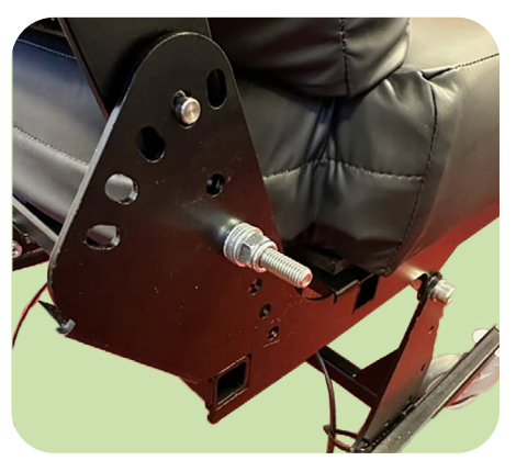
Easily Adjustable Back Angle