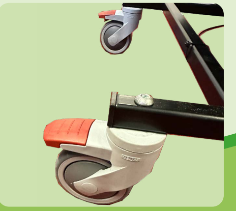
Standard specification includes 4 swivel 4" diameter castors with the 2 at the rear lockable

Primacare Ltd, Unit 26 Heads of the Valleys Industrial Estate, Rhymney, Tredegar NP22 5RL Telephone (01685) 845900 Fax (01685) 844538 www.primacare.co.uk