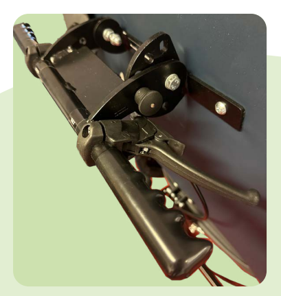
Optional Adjustable Position Push Handle