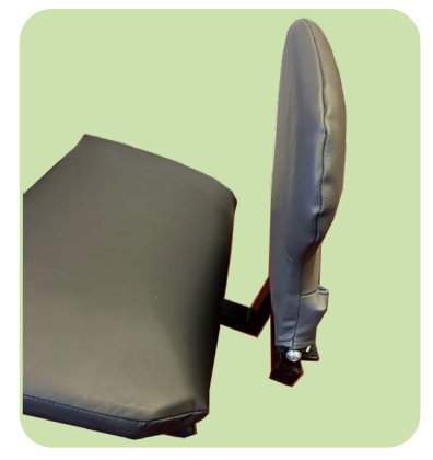
Optional Removable Adjustable Angle Footplate