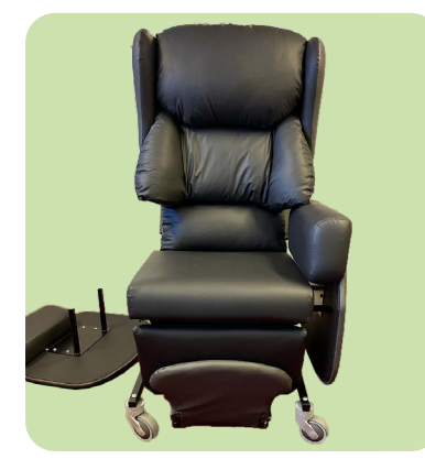
Removable Arm to enable side transfer and seat width adjustability