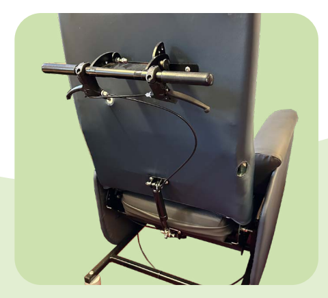
Optional Back Angle control using lever and gas spring