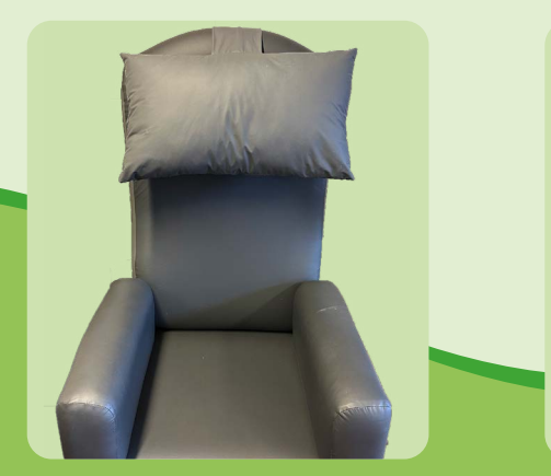
Optional Head Cushion