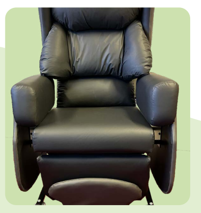
Removable Seat Cushion which is depth adjustable