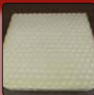
Cool Gel cushion