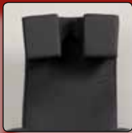
Head support cushion