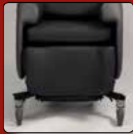
Leg rest channel cushion