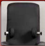
Foam head rest