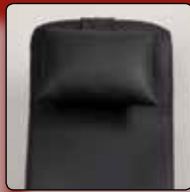
Soft head cushion