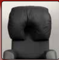
Profile head cushion