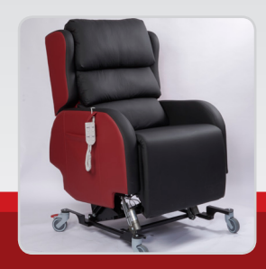
The chair can be raised 4" vertically