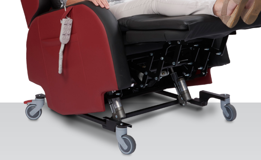
Affinity Bariatric Porter | features and options.