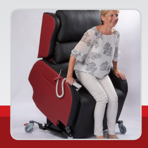
The Porter chair has a good high get out position