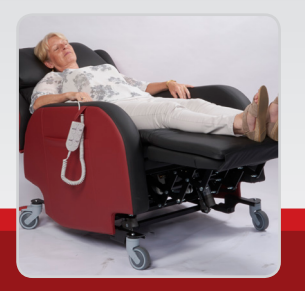
The Bariatric Porter can be reclined and tilted to create an almost bed like flat position