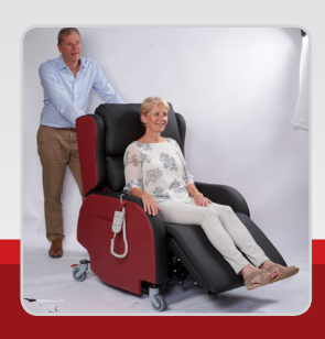
This is a heavy chair and one career will only move the chair small distances with the user seated.